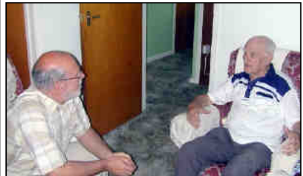
Many pensioners are concerned about cuts to home care and bus services