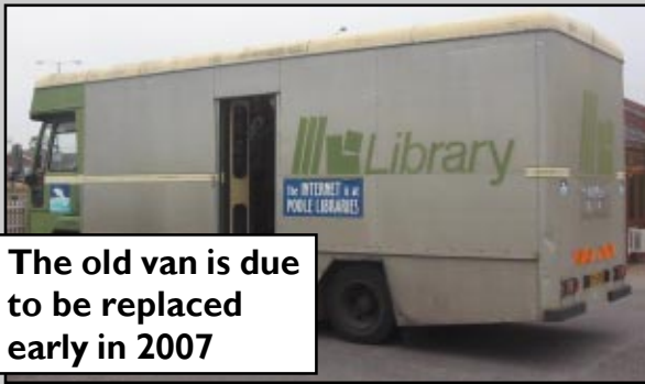
The old van is due to be replaced early in 2007