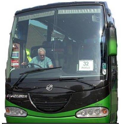
The route 32 to Poole will now be run by shamrock

"Public Transport is important, Liberal Democrat Councillors will be watching very carefully for more Tory cuts in bus subsidies." said Annette Brooke MP.