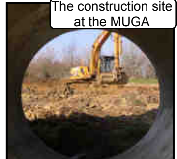
The construction site at the MUGA

The aim of the area is to provide more activities for young people. Lytchett Matravers School will have access to the MUGA during school hours and it will also be available to the public to book at other times. The name of 'Lytchett Astro' has been picked by the children. Completion is set for Easter.