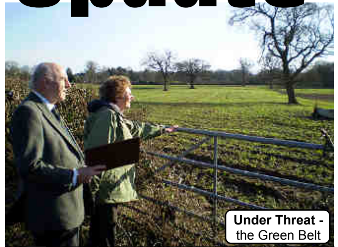
Under Threat - the Green Belt

Please let Annette have your views on these 'improvements' and on any further safety measures that you feel are required on the A35 between Morden and Bere Regis.